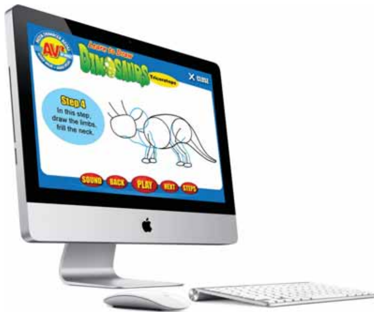
Sample taken from Dinosaurs

L earn to Draw teaches young readers the skills needed to draw their favorite animals and objects. This series features 11 fun topics from extreme sports to underwater life. Young artists will learn about their chosen subject with vibrant photos and engaging facts, then use easy to follow diagrams to draw it. Learn to Draw makes it fun and easy for beginners to learn about and draw their favorite things.